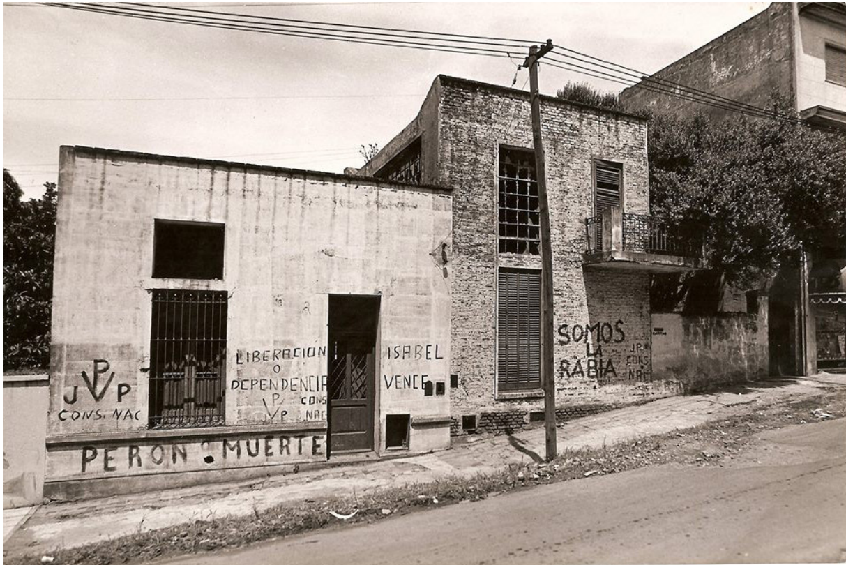
Figure 2. Villa Insuperable. Walls painted with political slogans. Early 1970s.