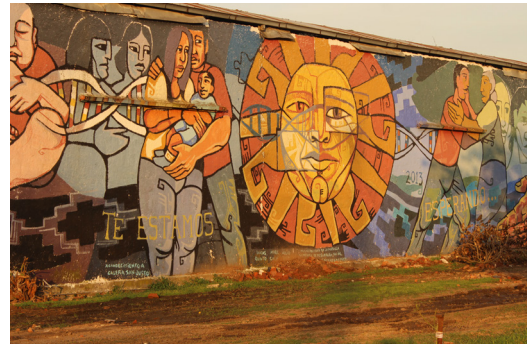
Figure 4. Mural by Lucas Quinto and Ariel Calo, Saint Justus.

His iconography represents elements of popular culture (bread, the sun, workers hands, football, the flag, indigenous peoples etc.) as well as root popular culture: Evita, Rodolfo Kusch, Scalabrini Ortiz, Arturo Jauretche among others. Within the context of the current Argentinian government (2015 – 2019), characterized by the implementation of neo-liberal politics and economic cutbacks in the budget for health and education, added to marked labor market flexibility and the subsequent loss of rights for the population, a phenomena that has already triggered marches and complaints from the most vulnerable social sectors, Santiago's work began to alternate between murals on different public walls and what he calls "militant rags". The new style consists of creating "mobile" murals painted on fabric (rags) to be transported and displayed at the varying marches decrying politics and social unrest in place since 2015. The new stage is a new interpretation of public space, and faced with a definable need creates a manner in which to take artistic discourse to the streets, and make it mobile. In this sense, discourse ceases to be static, and "marches" with protesters with manifest complaints.