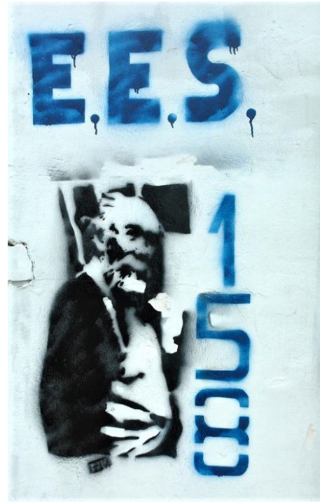
Figure 14. Stencil used on the walls of Secondary School N° 158, likeness of the artist Alfredo Zapata.

Hoffman in Madrid), becoming the category of communicational devices that invaded public space in Buenos Aires and the surrounding conurbation from the year 2000 onward. Technically it is a cutout template, made from acetate sheeting or x-ray sheeting, allowing the artist, after placing the template on the wall, to apply a layer of aerosol paint to then simply withdraw the template and leave an image. It is low resource technology, but does require specific skills and knowledge. In order to leave a legible formal message implies prior planning, considering the limitations of the medium in which the artist can only produce high contrast images.