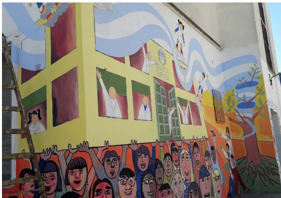
Figure 9. Mural at school 9 Villa Madero.

This process of intercultural dialogue encompasses representative value in developing integration, identity and social protagonism of the adolescent boys and girls at school. In this context, the General School Administration proposed painting murals of the May revolution, a special celebration that year due to the bicentennial anniversary of the republic on the 25th of May 2010. Workshops were set up allowing teachers from different schools to learn new techniques, including modern artwork such as mosaics. The proposal had a multiplying effect on muralism projects in and by schools throughout the entire district.