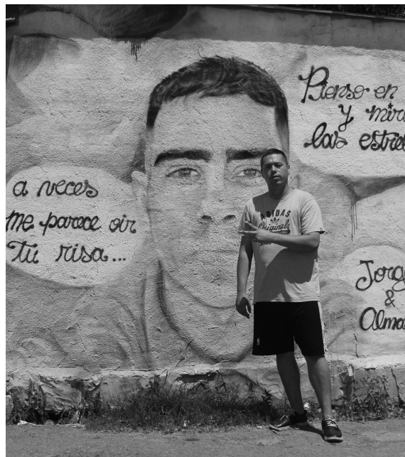
Figure 7. Neighborhood Puerta de Hierro. La Matanza.

One of the events that led to the reconfiguration of these types of practices was the República de Cromañon Nightclub fire. On the 30th of December 2004, a live music venue was burnt down. The Venue, called "República Cromañon" was located in the neighborhood Once (City of Buenos Aires) and managed by the businessman Omar Chaban. That night the rock band Callejeros was on stage, the majority of whose members were from La Matanza. The fire took the lives of 194 people, and left at least another 1,432 wounded, many of them locals. The tragedy had a definite and concrete effect on the area in which images of the fallen began to appear on the corners of Villa Celina, Villa Madero and Gonzalez Catan, among other neighborhoods.