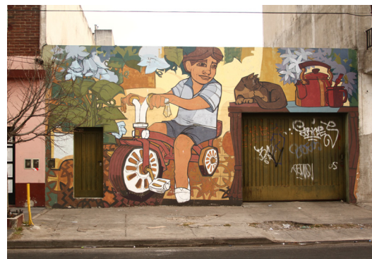
Figure 5. Mural by Julian Crigna, Villa Celina-