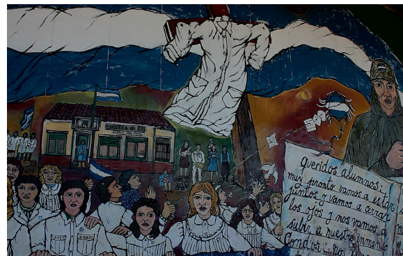
Figure 11. G. de Laferrere Station. Author: Santiago Vilas.