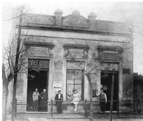
Figure 1. The Vega Family Store, La Matanza, circa 1935. Notice the poster stuck on the front announcing a show by the Bandoneonist Antonio Maggio.

The subgenre evolved until it became the default communications methods used by militant political groups. The groups charged with painting the walls had a system: one vehicle, the driver and the campana 1 , the “painters” all performed in the dark of night.